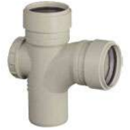
Swept Tee with Door