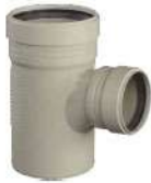
Reducing Swept Tee