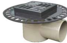
Plain Floor Trap