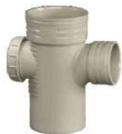
Reducing Swept Tee with door