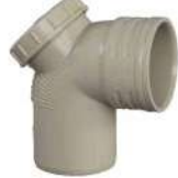
Bend 87.5° with Door