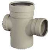
Reducing Swept Tee with door