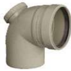
Bend 87.5° with Door