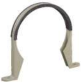
Pipe Clamp with Rubber Seal