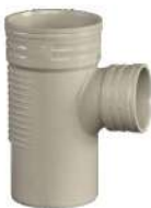
Reducing Swept Tee