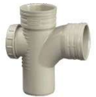
Swept Tee with Door