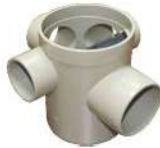
Sunken Multi floor Trap