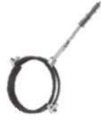
Metal Clamp with Rubber Seal